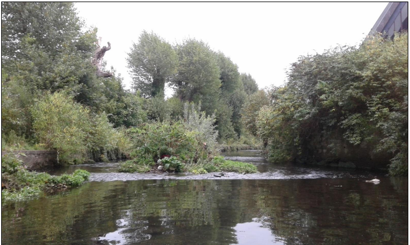
The Tolka River at St Mobhi Drive (Site 8)

Eight sites were surveyed on the Tolka River Catchment between the 4 th and 5 th of September 2017.