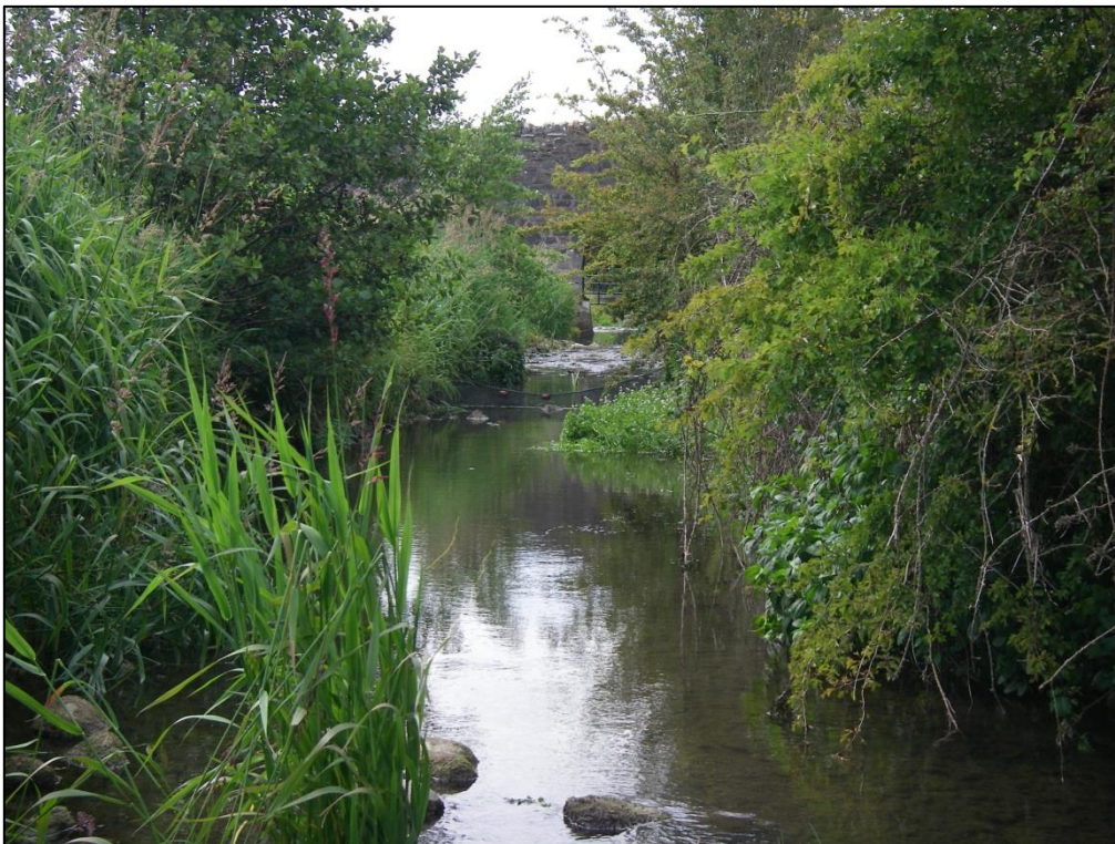
The Rye Water at Balfeghan Br., Co. Kildare (site1)

Three sites were surveyed on the Rye Water between the 14 th and 20 th of September 2018.